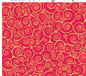
2182/R6 NEW Scroll