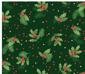
2377 G Holly Spray