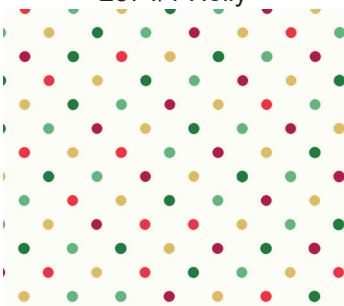
1948/Q2 Multi Spot